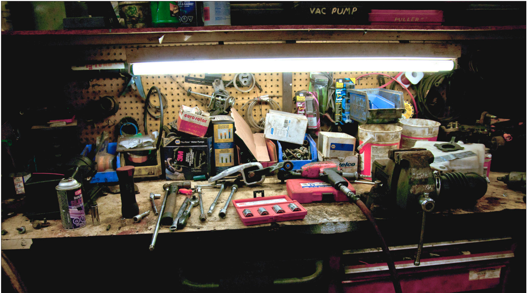
Located at 112 Station St., Allan's Auto Repair has been called one of the best auto repair shops in Quinte.