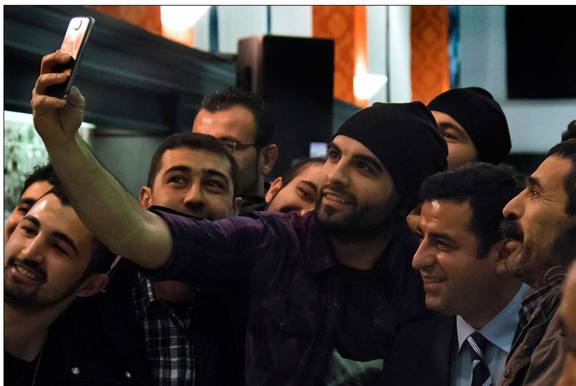
(Above, right) Supporters swarm Selahattin Demirtas (second from right), the leader of Turkey's Peoples' Democratic Party and the first openly Kurdish politician to run for president. More than a thousand people, mostly members of the Kurdish-Canadian community, came to hear Demirtas speak at a conference hall in Toronto on Feb. 9.