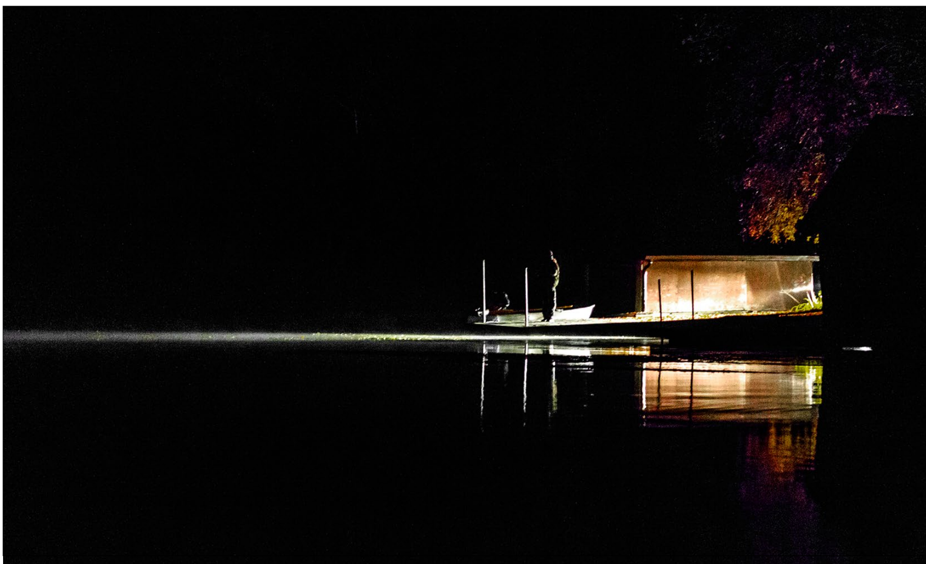
On duck hunting opening day on Sept. 27, a hunter looks off into the distance, mentally preparing himself for the day ahead.